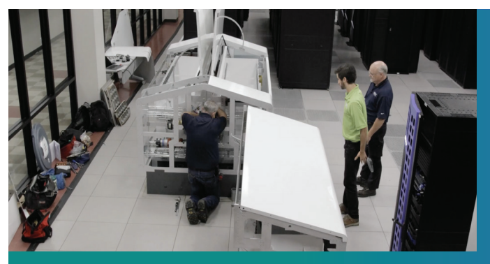
ICEraQ installation is straightforward and systems are operational in just days.

GRC's ICEraQ Series 10 Quad enabled TACC to triple their raw computing power within the same space and power envelope. That alone stood as an overriding reason to choose GRC. But other factors influenced their decision as well.