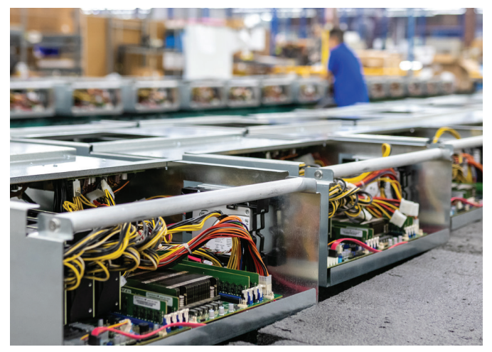
Immersion cooling was chosen to extract the heat from the massive GPU subsystem for the demanding projects the Frontera compute cluster was about to face.

Nor, despite its notoriety, is TACC exempt from dealing with issues like finite space or limited funding. In the latter case, the ICEraQ Series 10 Quad helped them optimize GPU processing with the allotted grant monies.